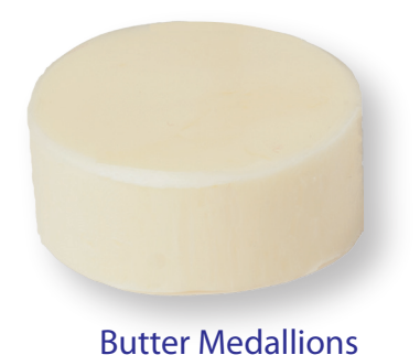
.4 & .5 Oz - Salted & Unsalted Cold Pressed