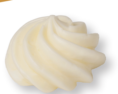
Rosette .5 Oz Salted and Unsalted