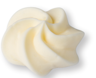
Mini Rosette .25 Oz Salted and Unsalted