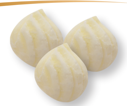
Butter Balls .25 Oz Salted and Unsalted